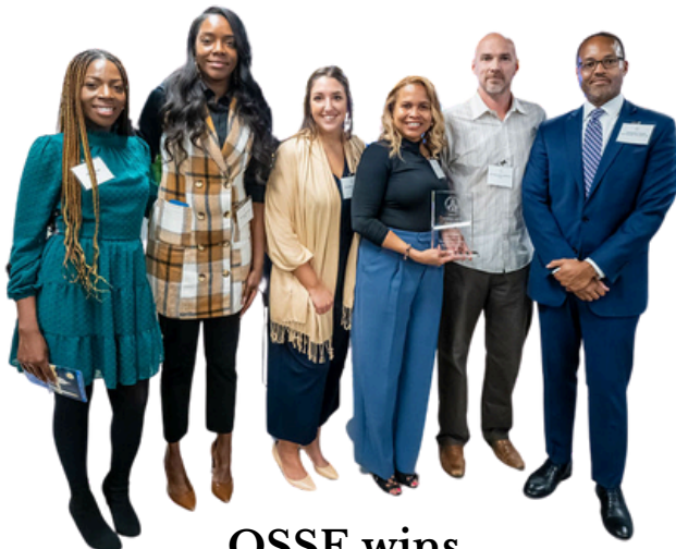
OSSE wins “Partner of the Year” Award!